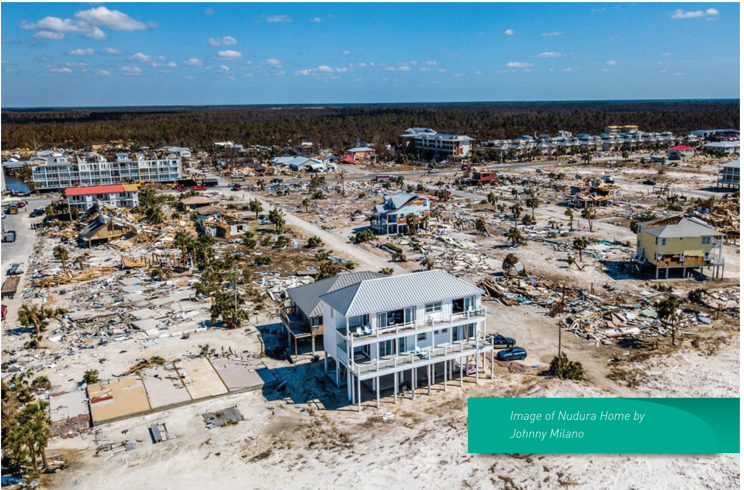
Image of Nudura Home

*Information provided by the ICFMA data report https://icf-ma.org/resources/thermal-study/ .